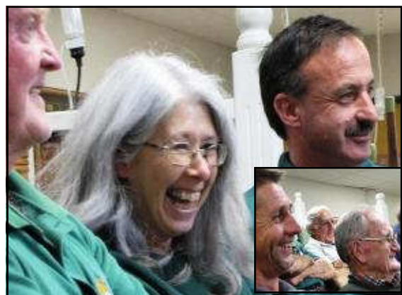
Amused Members of the audience