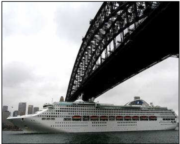
The Sun Princess sailing under Sydney Harbour Bridge