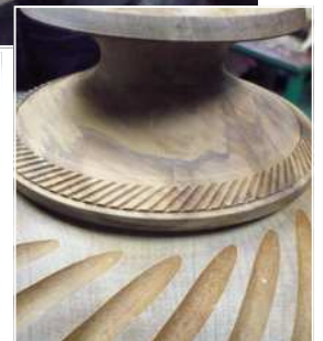
Something a little extra.